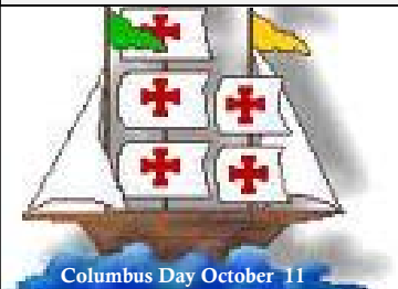
Columbus Day October 11