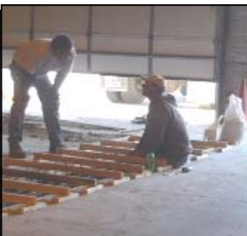
Maintenance working on phase two of our 2011 floor replacement project in building #2 in Findlay

The Ohio Truck Driving Championships is scheduled for June 17 and 18 of 2011 and will return to the Ohio State University parking area at the corner of Ackerman Rd. and St. Rt. 315. Headquarters hotel is again the University Plaza Hotel, 3110 Olentangy River Rd. The event is run by the Ohio Professional Roadeo Association, and all registration information must go through them. Log on to www.ohiotdc.com for registration forms, rules, and other information about how to participate.