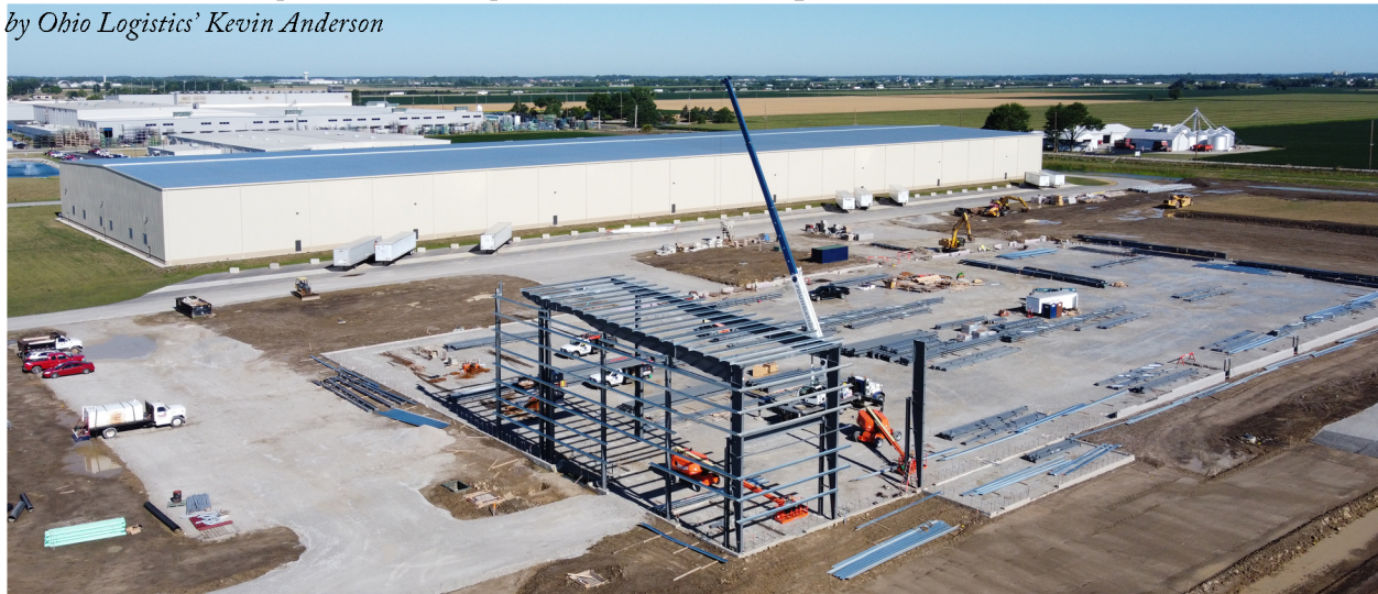
Ohio Logistics' Bowling Green warehouse. The 200,000 sq. ft. existing facility is in the background, with a 100,000 sq. ft. expansion underway in the foreground.

Our Bowling Green warehouse has been in operation for over two years, opening in June of 2018. Currently, we are at maximum capacity in our existing facility. An additional 100,000 sq. ft. building, with expansion capability to 200,000 sq. ft., is under construction to handle the growing needs of our customers.