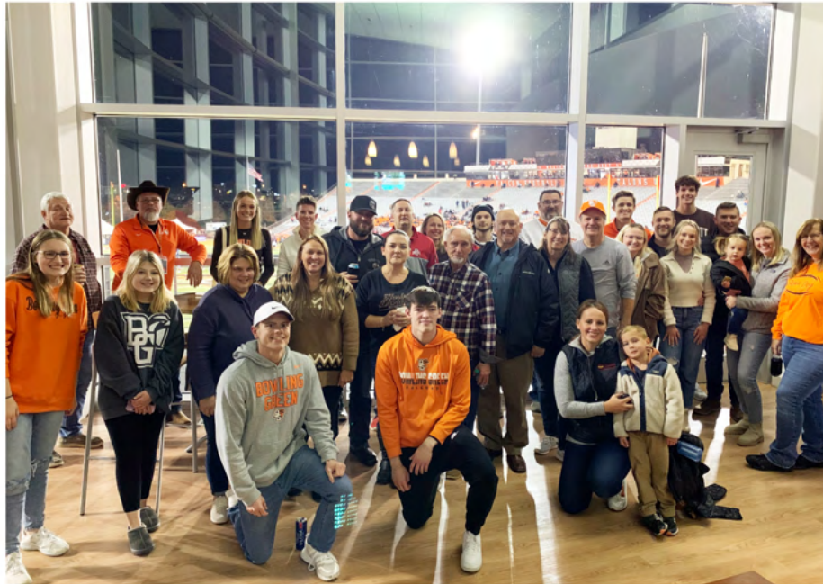
The Wilcox Boardroom at Doyt Perry Stadium in Bowling Green, OH served as the perfect venue for bonding between associates and customers, all while enjoying great food & beverages and catching some BG football action. It was an enjoyable evening!