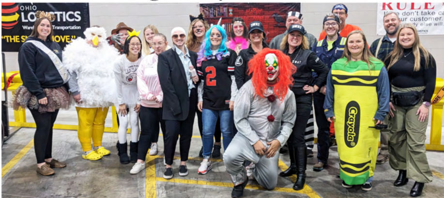
The folks shown here really aren't shady characters, but the same solid crew of outstanding Associates that keep Fostoria #1 running like a well oiled machine, proving that quality work and fun can go together.