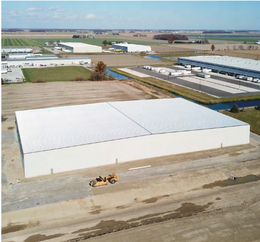
This 100,000 sq. ft. warehouse is scheduled to be complete by the end of 2023. Our other two Bowling Green warehouses can be seen side by side at the top of the image.

Under construction in Bowling Green's Woodbridge Industrial Park is Ohio Logistics' third and newest warehouse in Bowling Green. The 100,000 sq. ft. spec facility is located on 40 acres at 134 Woodgate Dr., Bowling Green, OH.