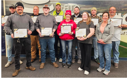
A.M. Leadership Program Class