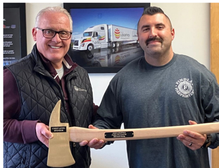
Findlay Firefighters Local 381 recognized Ohio Logistics for their support and sponsorship of their 2024 Annual golf outing with this beautiful "Chief Level Sponsorship Award."