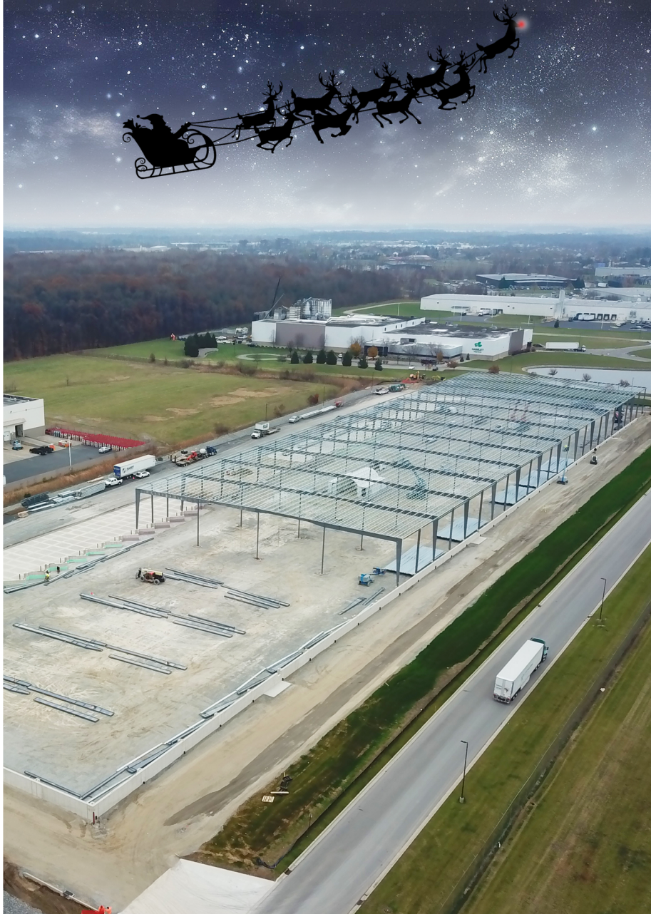
The structural steel is well underway at Building #5 in Findlay, OH. When completed, this facility will have 208,000 sq. ft. of state-of-the-art warehouse space.