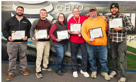
P.M. Leadership Program Class

Members of the 2024 Leadership Training Program received their certificates after completing nine weeks of career development training. The Leadership Training Program is designed to invest in our Associates' education and enhance career development.