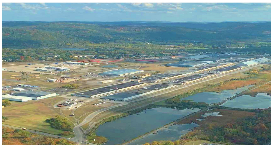
Aerial view of recently acquired Horseheads Southern Tier Logistics Center