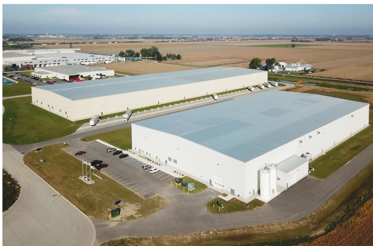
Bowling Green Warehouse, 300,000 sq. ft. .... so far!