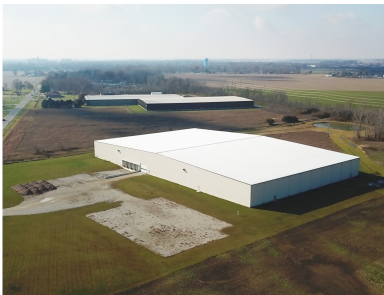
Fostoria #3 Warehouse, 100,000 sq. ft. (with room for 200,000 sq. ft. expansion)