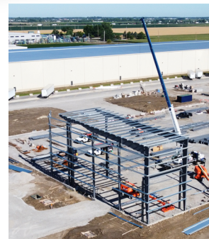
BG under construction

Our growth has been very rewarding! Without our outstanding Associates and customers, we wouldn't be where we are today. And for that, we are indeed fortunate and thankful.