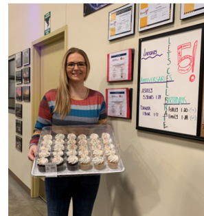
Celebrating in Bellevue, OH