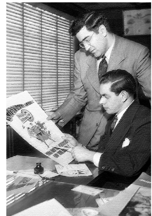
Jerry Siegel and Joe Shuster

Initially rejected by publishers, Superman found a home in Action Comics #1 in 1938, published by Detective Comics (later DC Comics). The character's bold costume, super-human abilities, and unyielding morality resonated with readers, launching the superhero genre. Though Siegel and Shuster faced challenges in retaining rights to their creation, their work laid the foundation for modern comic books and inspired countless creators and fans worldwide.