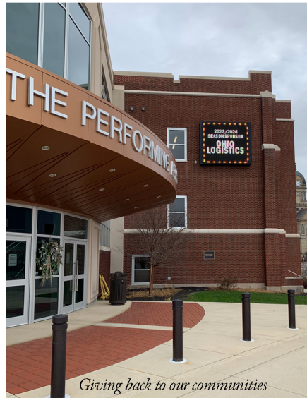
Giving back to our communities