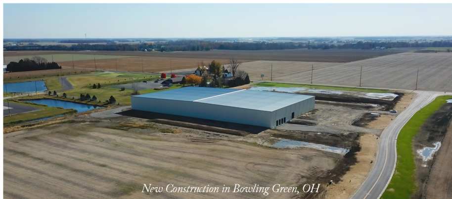
New Construction in Bowling Green, OH