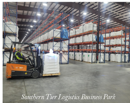
Southern Tier Logistics Business Park