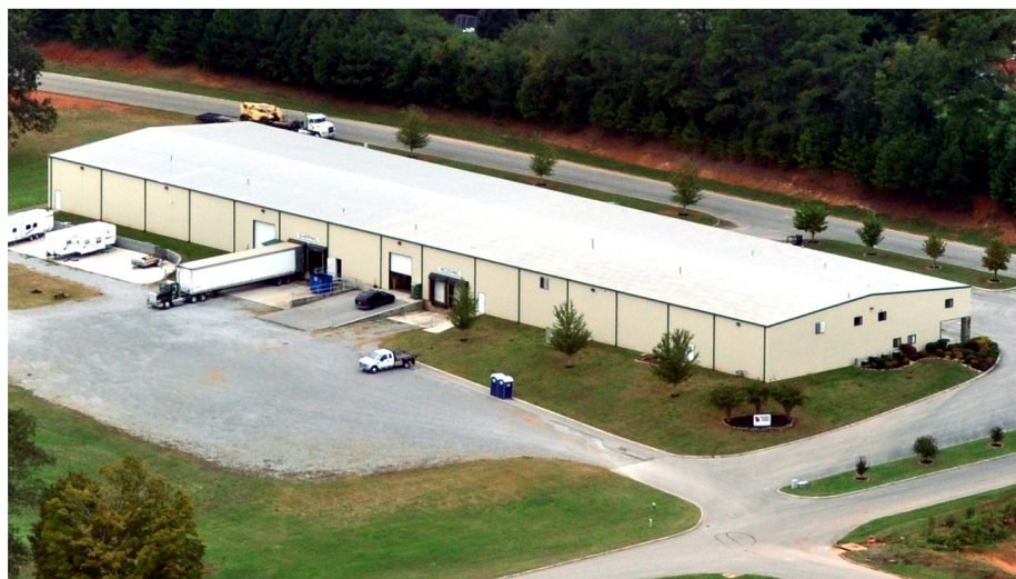
Rock Spring, GA Facility

Learn more about our Division in the Peach State