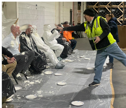
And it's a strike, right down the middle!

The First Step was very thankful for the donation, and added that every dollar of the proceeds would go directly to helping the families in need, as opposed to building expenses or staffing costs.