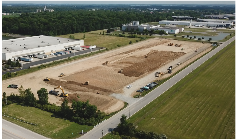
July 25, 2024