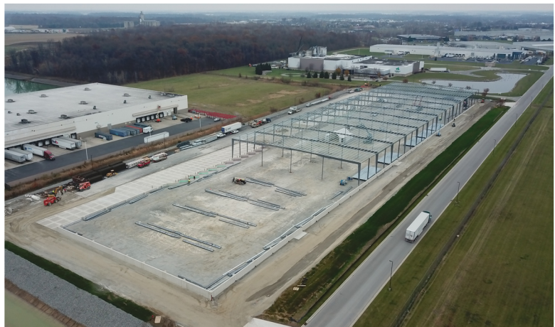
November 18, 2024