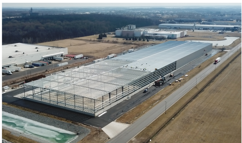
February 25, 2025