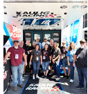
Friends and family of Ohio Logistics enjoyed another exciting race weekend last month in Bristol, TN