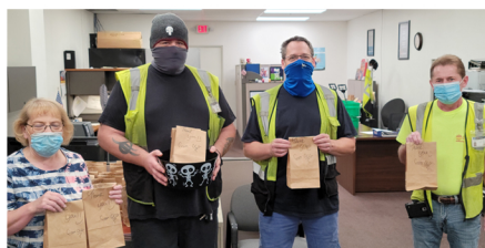
Ohio Logistics associates prepare treat bags with hand written notes showing appreciation to our great drivers.

Nearly every aspect of daily life is made possible because a truck driver delivered the goods and resources people need.