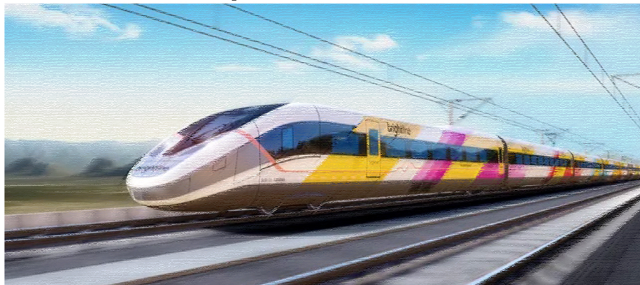
A rendering of the "American Pioneer 220" train set that will be built for the Brightline West high-speed rail project connecting Las Vegas and Southern California.

America's newest high-speed rail system will feature trainsets manufactured in the Southern Tier.